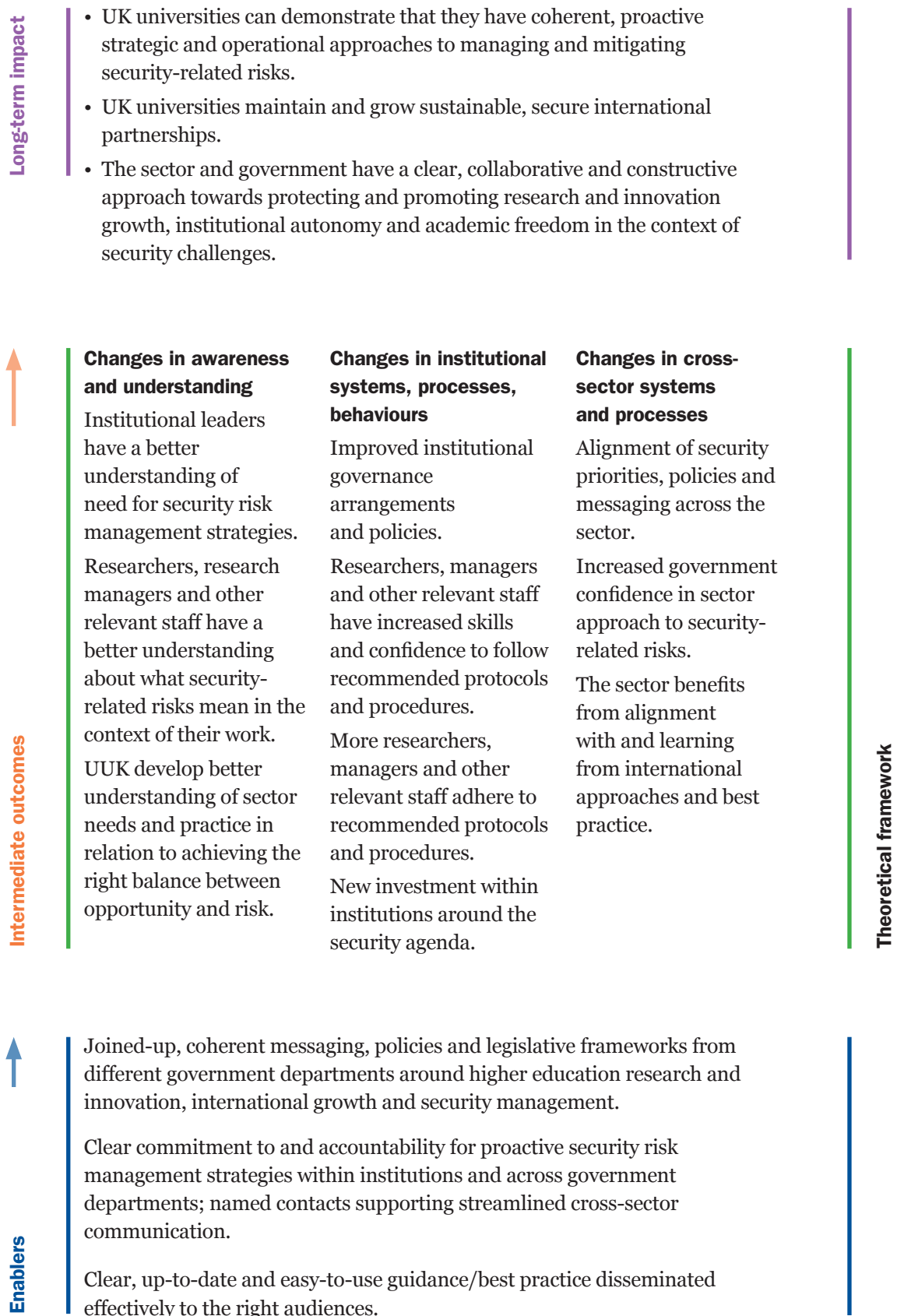
Figure 2: UUK programme of work